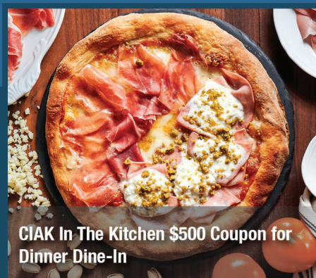
CIAK In The Kitchen $500 Coupon for Dinner Dine-In