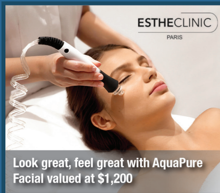
Look great, feel great with AquaPure Facial valued at $1,200