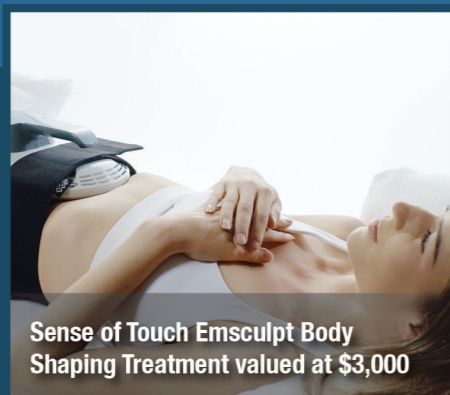
Sense of Touch Emsculpt Body Shaping Treatment valued at $3,000